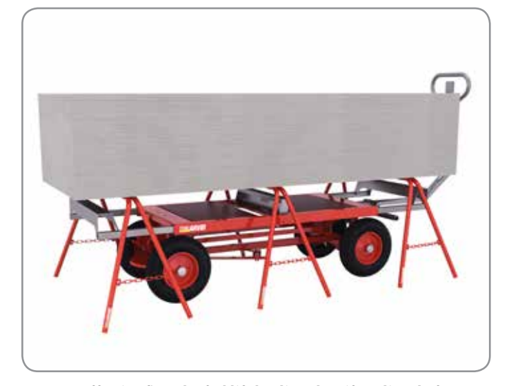
Create effective flows by forklift loading the Lift-8 directly from the truck and transport the board to its location in the building.