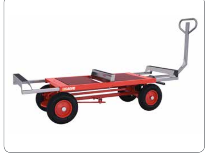
Lift8 3.0 has new improved steering control that provides a narrow turning radius of 1.6 meters in both directions. Compact lightweight chassis with extendable supports perfect for transporting longer plasterboards.