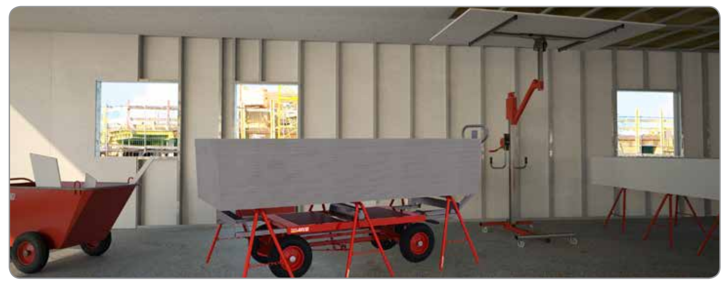
The Lift8 is a central part of our now classic system that handles the plasterboard from truck to assembly site without the need for a single person to handle a single sheet. Profitability is often described as a 50 % labour cost reduction with the added benefits that the plasterboard is off the floor preventing damage and poor ergonomics.